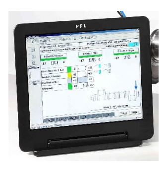
Displays and software